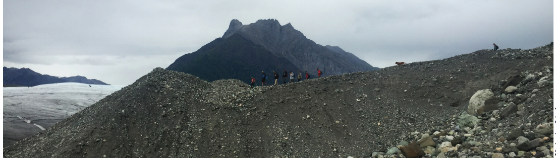
▲ Hiking out to the Root Glacier, one of the WMC's favorite classrooms