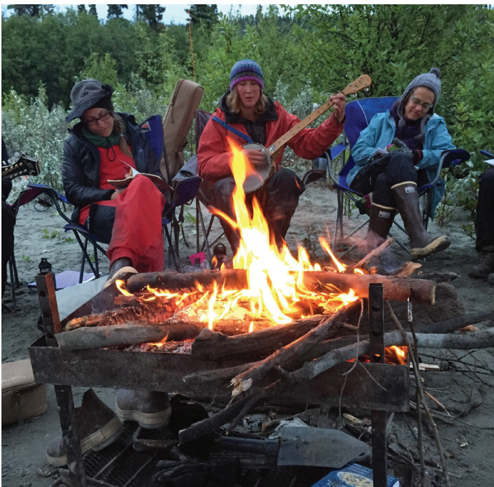
▲ Playing music and writing songs and poems around the fire keeps RiverSong students and instructors warm into the evening