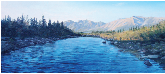
▲ Kevin Muenta's painting of the swimming hole is now part of the WMC permanent collection