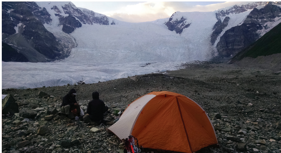
▲ End of the day below the Stairway Icefall.